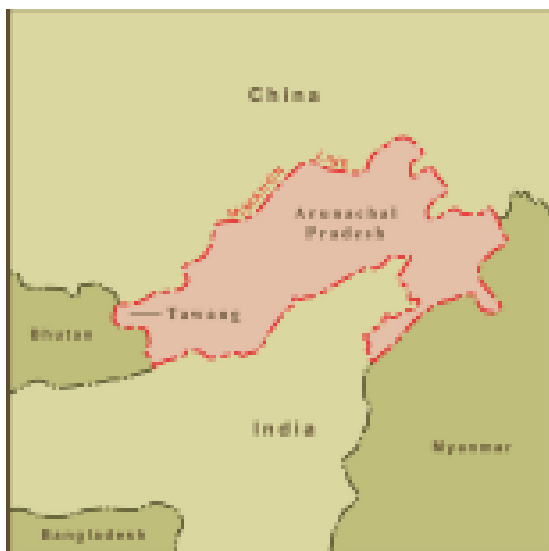
Figure 5: Map of conflict region, Arunachal Pradesh

Independent India utilised the Johnson Line, as confirmed by the Prime Minister's motion to reinforce this in maps. However, the Johnson Line had not originally been presented to China, since the (fallen) Qing dynasty had been the one to accept it.