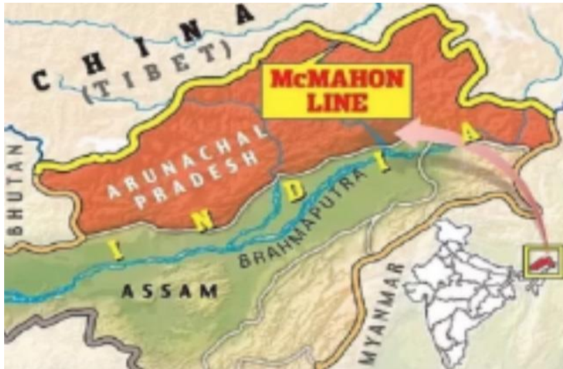
Figure 3: Map of McMahon Line