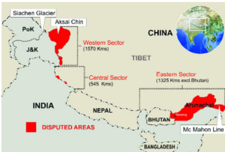
Figure 4: Map of disputed regions on Sino-Indian border

The heart of the conflict lies in the lack of specificity of the original border. Once India gained independence and the Republic of China— and later the People’s Republic of China— was established, it was not explicitly confirmed how the division of land would translate to these new definitions of East Asia.