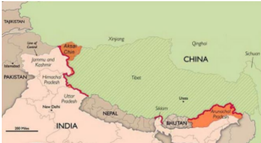
Figure 1: Map of LAC & disputed regions along it