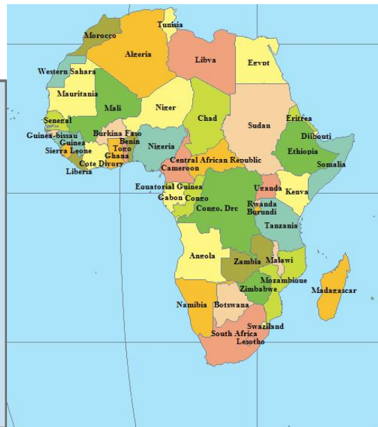
Figure 2: Somalia on the African map