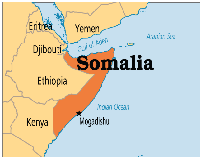
Figure 1: zoomed in image of Somalia on the African map