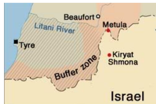
Region targeted by Israel during operation Litani.

During the night of 14 th March 1978, some 25,000 Israeli soldiers crossed the Lebanese borders in order to wipe out all terrorist facilities between Israel and the Litani River that crosses South Lebanon, not 20 miles from the Israeli border.