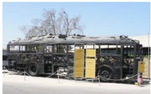
The bus that was hijacked by the 11 PLO members on the 11 th of March 1978.

The Coastal Road massacre was the origin of the Israeli invasion from 1978. It was an attack involving the hijacking of a bus within Israel in which 38 civilians, including 13 children were killed. The attack was carried out by 11 members of the PLO and its objective was to seize a luxury hotel in Tel Aviv and to take hostages in order to exchange them for Palestinian prisoners held by Israel. According to the Time magazine of 1978, "their orders were to kill until they themselves were killed". It is therefore unnecessary to say that this Palestinian suicide mission left a trail of dead