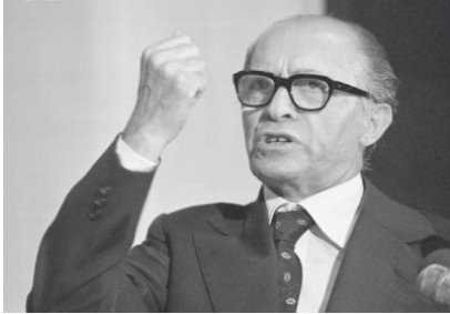
Israel's Prime minister, Menachem Begin "Menachem Begin." Menachem Begin . N.p., n.d. Web. 08 Aug. 2014. < http://www.whale.to/b/begin_h.html >.

and wounded civilians along Israel's main coastal highway ending only with arms fire between the members of the PLO and the local police forces near Herzliya (central coast of Israel, at the Northern part of the Tel Aviv District).