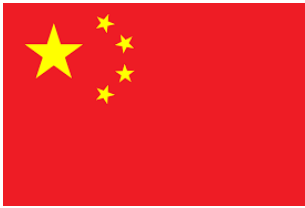
China (Flag of the People's Republic of China)

part of India. Their attempts in winning over the region include an outspoken willingness to grant autonomy to the region so long as they remain under the Indian constitution.