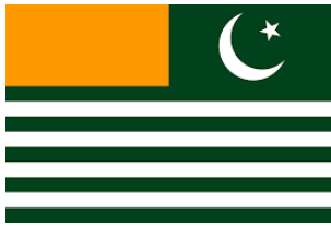
Kashmir (Flag of Kashmir)

Overall, China's stance has been against India in support of Pakistan. They are in control of Aksai Chin which is seen to be a part of Kashmir, yet they do not recognise it as such. It further disputed the borders with another autonomous region of Tibet in various locations.