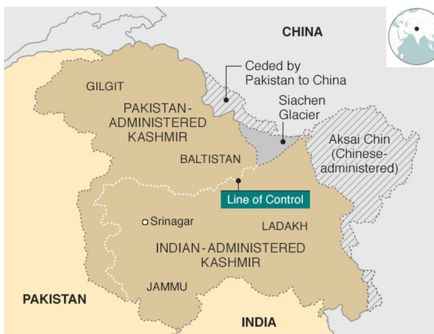
(A depiction of the split borders between Pakistan,

relation to the surrounding states. Britannica.com).