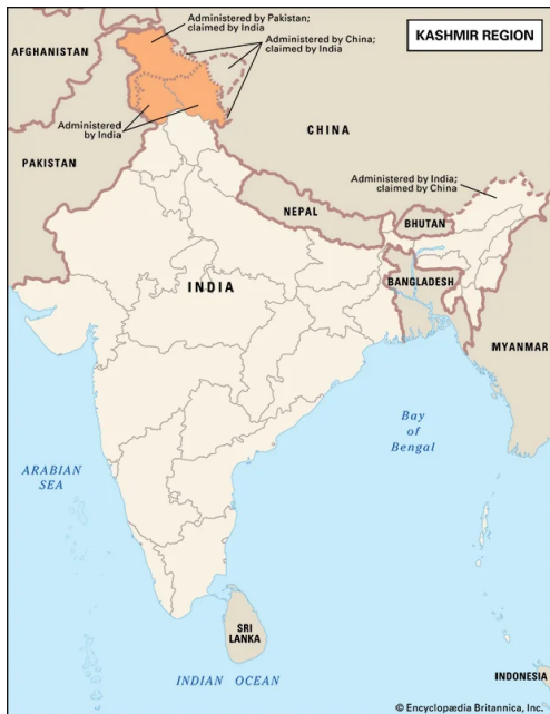
(A map of South Asia depicting the location of Kashmir in

administering the western and northern portions. Gilgit, Azad Kashmir and Baltistan comprise the three areas in which Pakistan holds authority, the first and last being known also as Gilgit-Baltistan to create a single administrative unit. The areas administered by India are in the south and southwest named Jammu and Kashmir, and Ladakh. The Pakistani and Indian territories are divided by a construct of a 1972 agreement named the “line of control”; however, the two nations fail to recognise this as an international boundary.