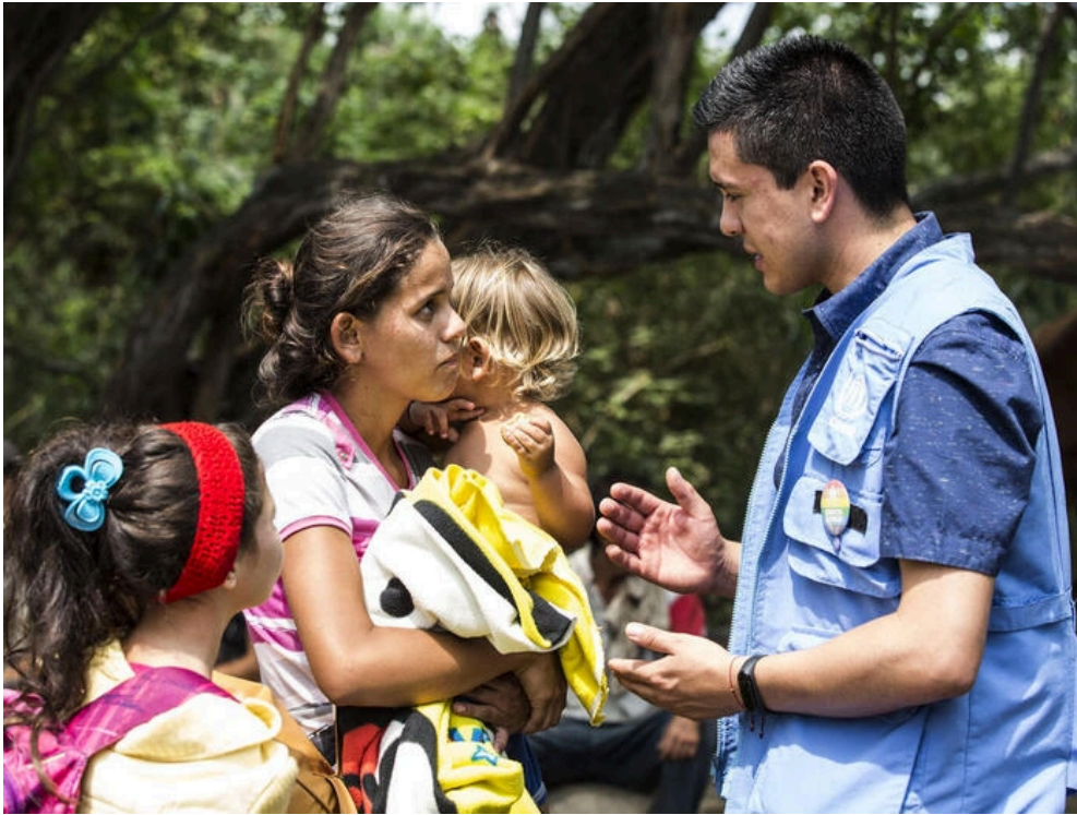
A woman with two children talking to a UNHCR worker in Colombia