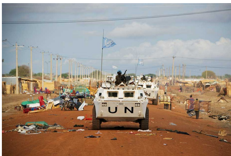
United Nations peacekeeping forces in Sudan

In 2004, the discontinuance of belligerency in Sudan and the expansion of unrefined petroleum (more commonly known as crude oil) resulted in an almost doubling of the Gross Domestic Product (GDP) per capita since 2003. The two-decade civil war and poor infrastructure stood in the way of further growth. Measures were also taken to establish a market-based economy (rather than socialist based); however, the government remained engaged with the economy. With the separation of the two