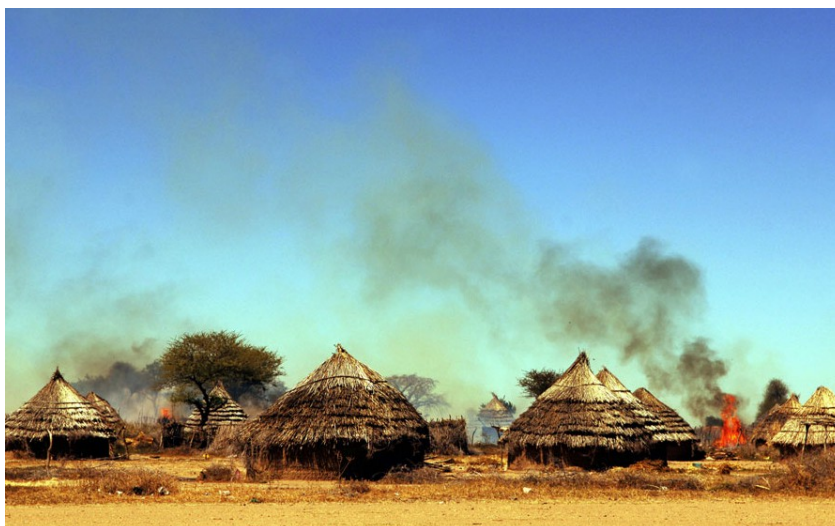
Villages burnt by the Janjaweed (the Arab militia) in Darfur

Luckily, in the last few months, the revolting groups have shown growing desires to cooperate. On July 14 th of 2011, the Darfur Peace Agreement was signed by the government, the SLA and the JEM.