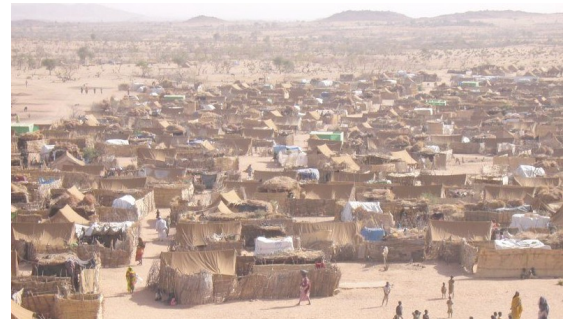
Sudanese refugee camp in Chad