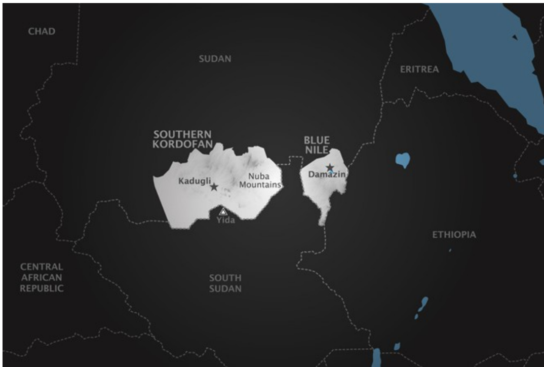
Map of The Three Areas (Abyei is located in the south-western part of Southern Kordofan)