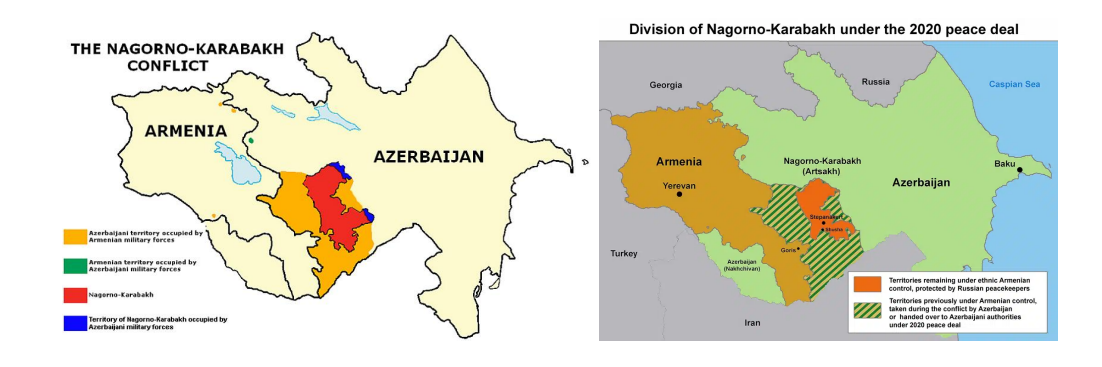
Map. 1 Division of territory after 1994

With recently gained strength Azerbaijan launched an offensive attack at the Azerbaijan-Nagorno-Karabakh border on September 27th 2020. This war would result in the death of more than seven-thousand soldiers and civilians and would cause the displacement of 91000 individuals from Nagorno-Karabakh to Armenia. Even though Armenia triggered a Collective Security Treaty Organization (CSTO) appeal to the Russians and the rest of the alliance for direct military assistance. It was refused as they proclaimed that Armenia's land itself was not under direct attack. On November 8 Azerbaijan won its biggest victory when capturing the historic city of Shusha. Armenia surrendered having now only control over a small reading of Nagorno-Karabakh. On November 9th Russia successfully brokered a deal which would be reinforced by Russian peacekeepers who would also monitor the newly established Lanchin corridor.