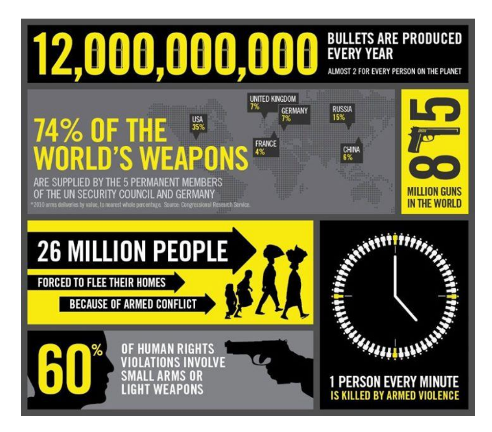
Fig 2: Figures around the world arms market